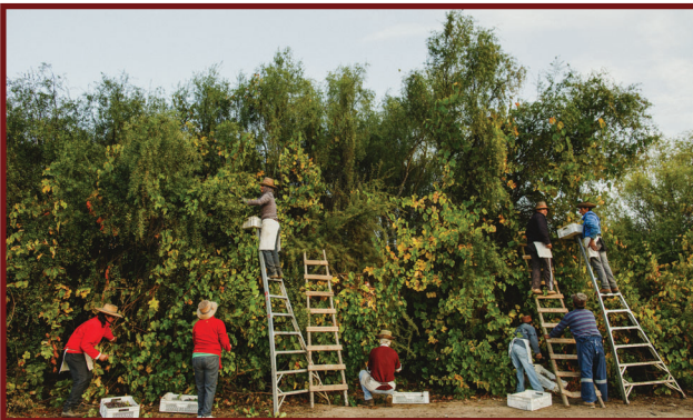
Using ladders to harvest the Pais Salvaje wild vines

J. Bouchon leads Chile's wine evolution by revitalizing ancient Pais vines in the Maule Valley to preserve their ancestral viticulture and transform Chile's modern wine chapter.