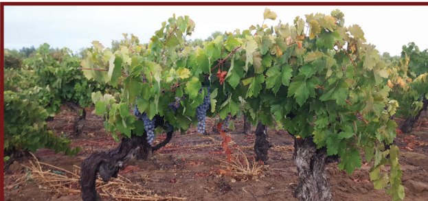
Over 100-year-old Pais vines in Maule