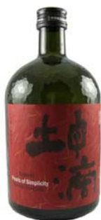
KONTEKI Pearls of Simplicity junmai daiginjo